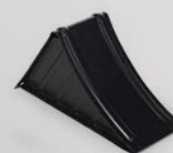
CHOCK 5 T REF 105TA4045