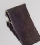
CHOCK 20 T REF 106TA6391