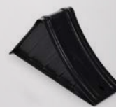
CHOCK 1,5 T REF 105TA4044

3 SAFETY TRESTLE REF 124TA2106 Capacity: 15 ton Length: 1200mm Height: 1080 - 1300mm Width: 550mm Wheels: rubber 200mm Weight: 70kg 5 Adjustable Heights